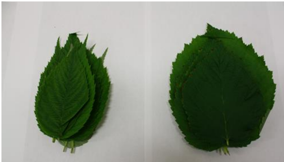
Pic. 3 Young leaf sample (left) and an old leaf sample (right)