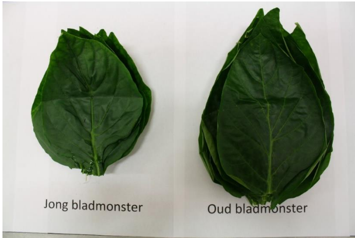
Pic. 1 Young (left), Old (right)