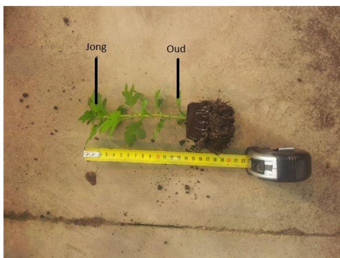
Pic. 1: 1 week old plant

It is not allowed to send in samples that have a fungal, bacterial or virus infection. The leaves must also be free from insects.